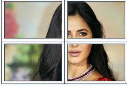
No Bezel Compensation