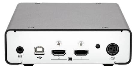
ADDERLink INFINITY 2124T - Rear