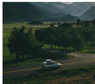
NEWS & WEATHER