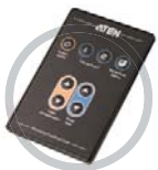
IR Remote Control Included