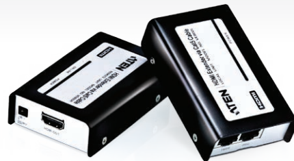
❑ VE800 / VE810 - Dual Cat5 HDMI Extender