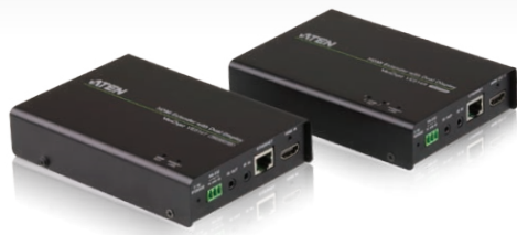
❑ VE814 / VE812 - HDBaseT HDMI Extender