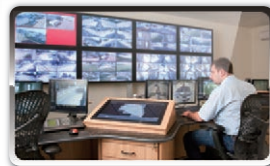
Traffic Control Center