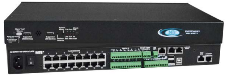
E-16D (Front & Back)