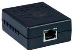
E-STHS E-STHSB E-STHS-99