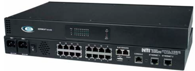
SERIMUX-S-16DP (Front & Back)