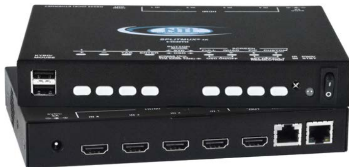
SPLITMUX-4K-4RT (Front & Back)