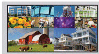
Cascaded (4K, 2K, 1080p, 1920x1200)