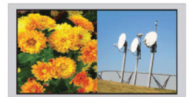
Dual Screen with Custom Mode (2K, 1080p, 1920x1200)