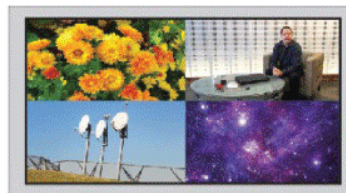
Quad Mode (4K, 2K, 1080p, 1920x1200)