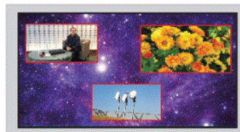
Custom Mode with Individually Configured Windows and Enabled Borders (2K, 1080p, 1920x1200)