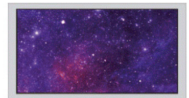
Full Screen Mode (4K, 2K, 1080p, 1920x1200)