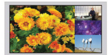
PIP Mode (2K, 1080p, 1920x1200)