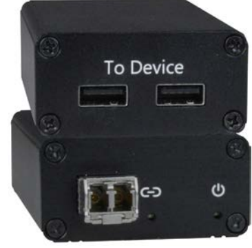
USB3ONLY-2FOLCx (Remote and Local Units)