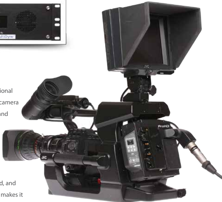
*GY-HM890 full studio configuration

There's never been a more versatile high quality professional camera than JVC's GY-HM890U—an advanced 3-CMOS camera that delivers pristine HD images to solid state memory and streams via Wi-Fi or a plug-in LTE modem. It features a removable 20x Fujinon auto-focus lens, 4 channels of audio, dual memory card recording at up to 50 Mbps, an external HD-SDI pool feed input, and a full complement of fiber and multicore studio options. It's the most feature-rich HD camera JVC has ever offered, and now, the availability of the FS-900 Fiber Remote System makes it truly an essential component of any modern broadcast company.