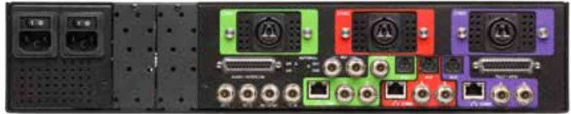
FS-900 Rear Panel Configuration

Designed for total integration with existing systems, the FS-900 base station offers complete connections for video (two HD/SDI outputs with return SDI and VBS connections for analog signals), audio (RTS TW intercom module) and sync/control functions (bi-level or tri-level sync, prompter input, time code, GPI signals and remote camera control input), providing unprecedented control for a range of field applications.