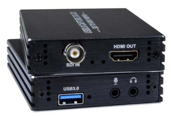
3GSDI-USB3-CPTR-HDO (Front & Back)

The 3G-SDI to USB 3.0 Video Capture device is used to record or stream an SD/HD/3G-SDI signal via USB 3.0 at up to 350 MB/s. It features an HDMI loop output for local display, as well as separate 3.5mm stereo audio input/ output connectors.