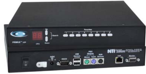
PRIMUM-UZR (Front & Back)