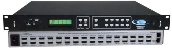
VEEMUX® SM-16X16-HD4K (Front & Back)