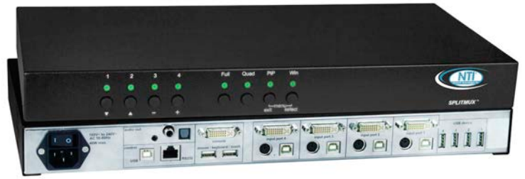
SPLITMUX-DVI-4RT (Front & Back)

The SPLITMUX® DVI/VGA Quad Screen Multiviewer simultaneously displays video from four different computers on a single monitor. Additionally, it can switch one of the four attached computers to a shared keyboard and mouse for operation and to four additional USB devices.