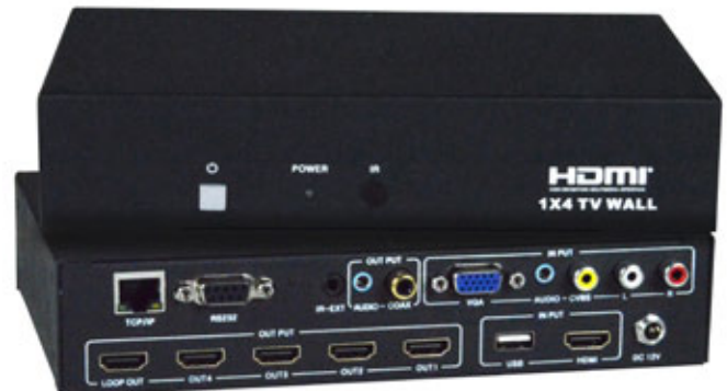
SPLITMUX-VWC-4HDLC (Front & Back)

The SPLITMUX® Multi-Format HD Video Wall Controller allows you to display the video from one HDMI, VGA or composite video source across four 1080p HDMI monitors. Two processors can be cascaded to create a video wall up to 3x3 - 9 screens. Additionally, it can be used as a video splitter, video converter and video switch.