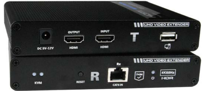
ST-C6USB4K18GB-230T (Local & Remote Unit)

The XTENDEX® 4K 18Gbps HDMI USB KVM Extender via One CAT6/6a/7 Cable provides remote KVM (USB keyboard, USB mouse and 4Kx2K 60Hz UHD HDMI monitor) access to a USB computer up to 230 feet (70 m) away via CAT6/6a/7 cable.