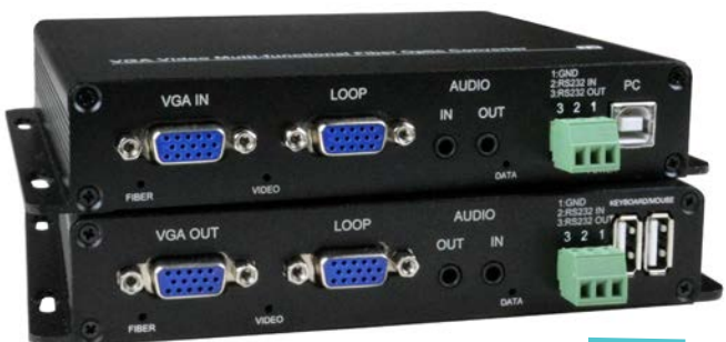
XTENDEX ST-FOUSBVARS-LC12V (Local and Remote Unit)