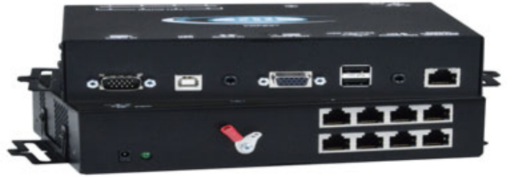
VOPEX-C5USBVA-8 Local Unit (Front & Back)

The VOPEX® VGA USB KVM Splitter/Extender allows up to eight remote users (8 USB keyboards, mice, and VGA monitors) to access one USB computer (PC, SUN, MAC) located up to 1,000 feet away using CAT5/5e/6 cable. Audio can be broadcasted to self-powered stereo speakers at the local unit and each remote location.