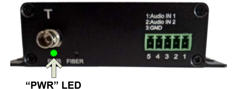
Step 2: Connect Fiber

Connect Transmitter to Receiver using Single Mode Fiber (Not Included)