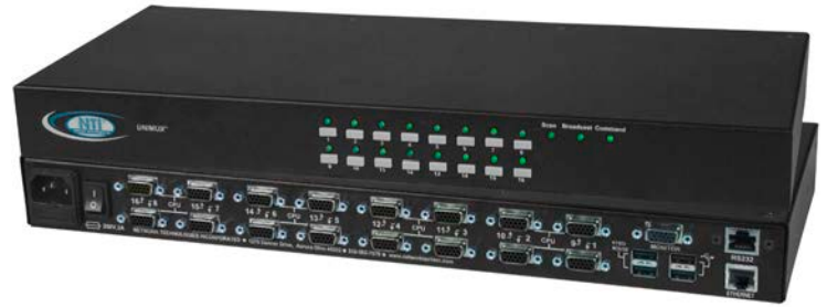
UNIMUX-USBV-16HDUT (Front & Back)