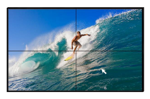
Full 60Hz perfectly outputs