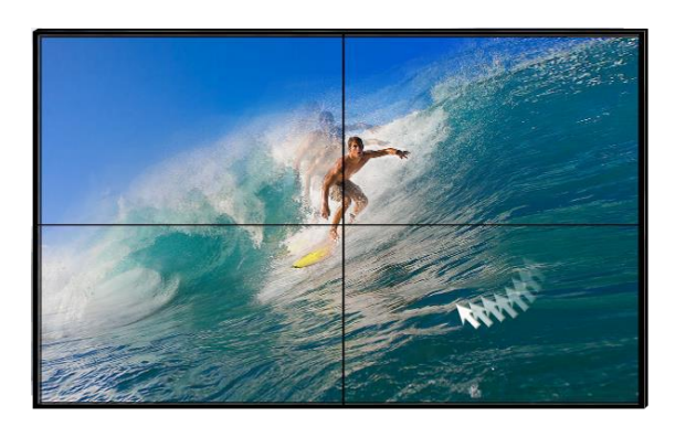
Non 60Hz dynamic image

VPX-500 provides full 60Hz perfect outputs that effectively resolve dynamic image ghosting caused by the low frame state and present sharp dynamic images.