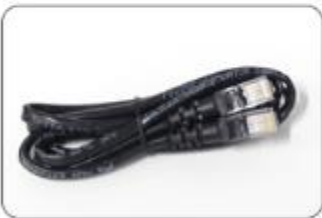
CK-Link CAT 5E